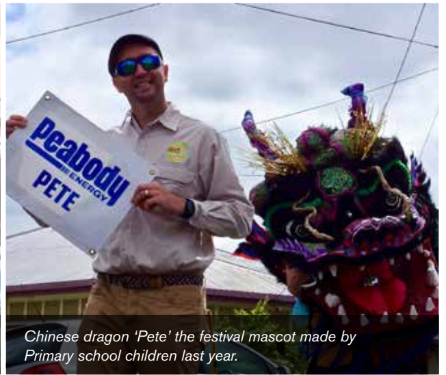
Chinese dragon 'Pete' the festival mascot made by Primary school children last year.