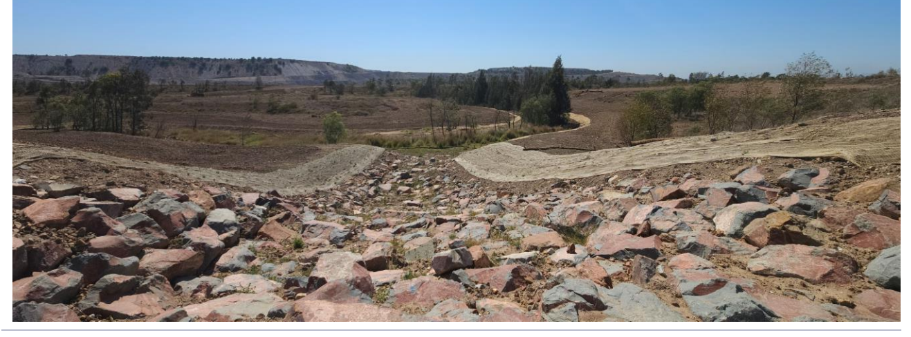
Remediation works to the NWCD, with ripping and seeding recently completed