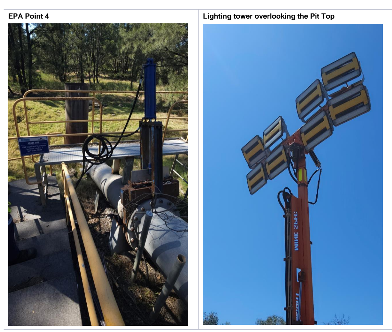
Fenced off effluent discharge area, noted to also include United Wambo Joint Venture effluent discharge area