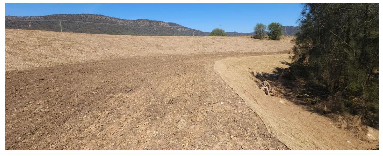
Remediation works to the NWCD, with ripping and seeding recently completed