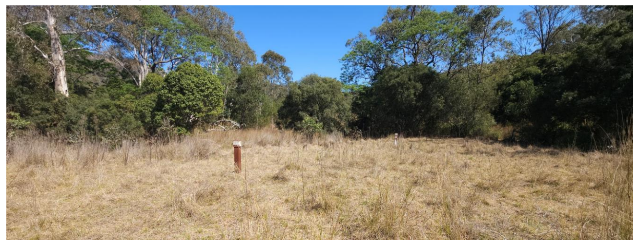
Subsidence repairs near North Wambo Creek Diversion (NWCD), and remediation works to the NWCD