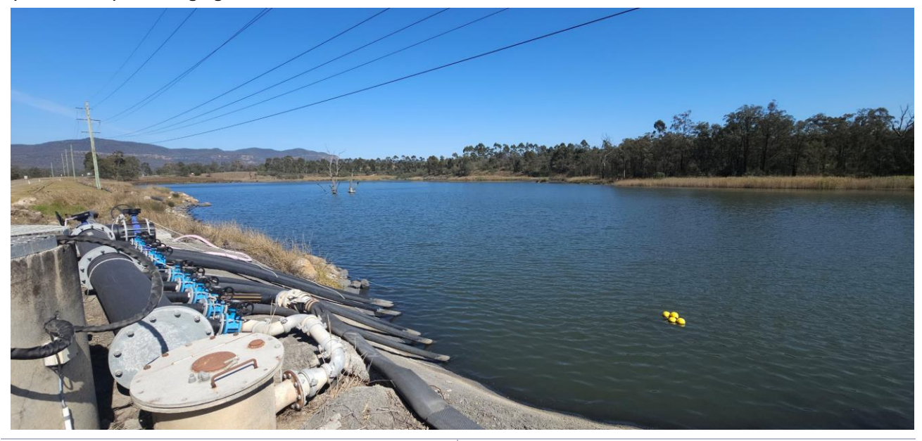
HRSTS Instrument Panel, including water quality testing point

Eagles Nest dam, with Hunter River Salinity Trading Scheme (HRSTS) outlet to licensed discharge point (LDP) (EPA Point 4), discharging to Wollombi Brook