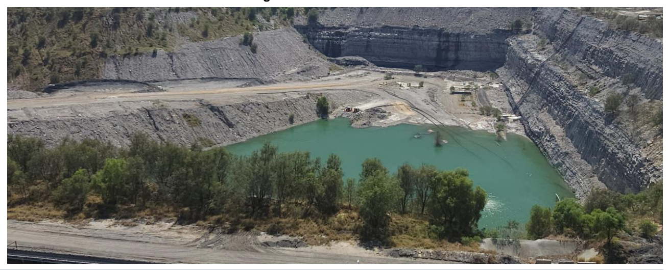
Former tailings storage area, currently being filled in by WCPL in preparation for rehabilitation to be completed by the UWJV