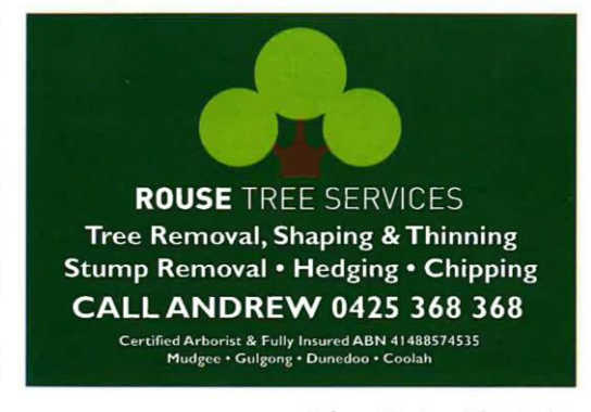
Gulgong Gossip • July 2024 | 31